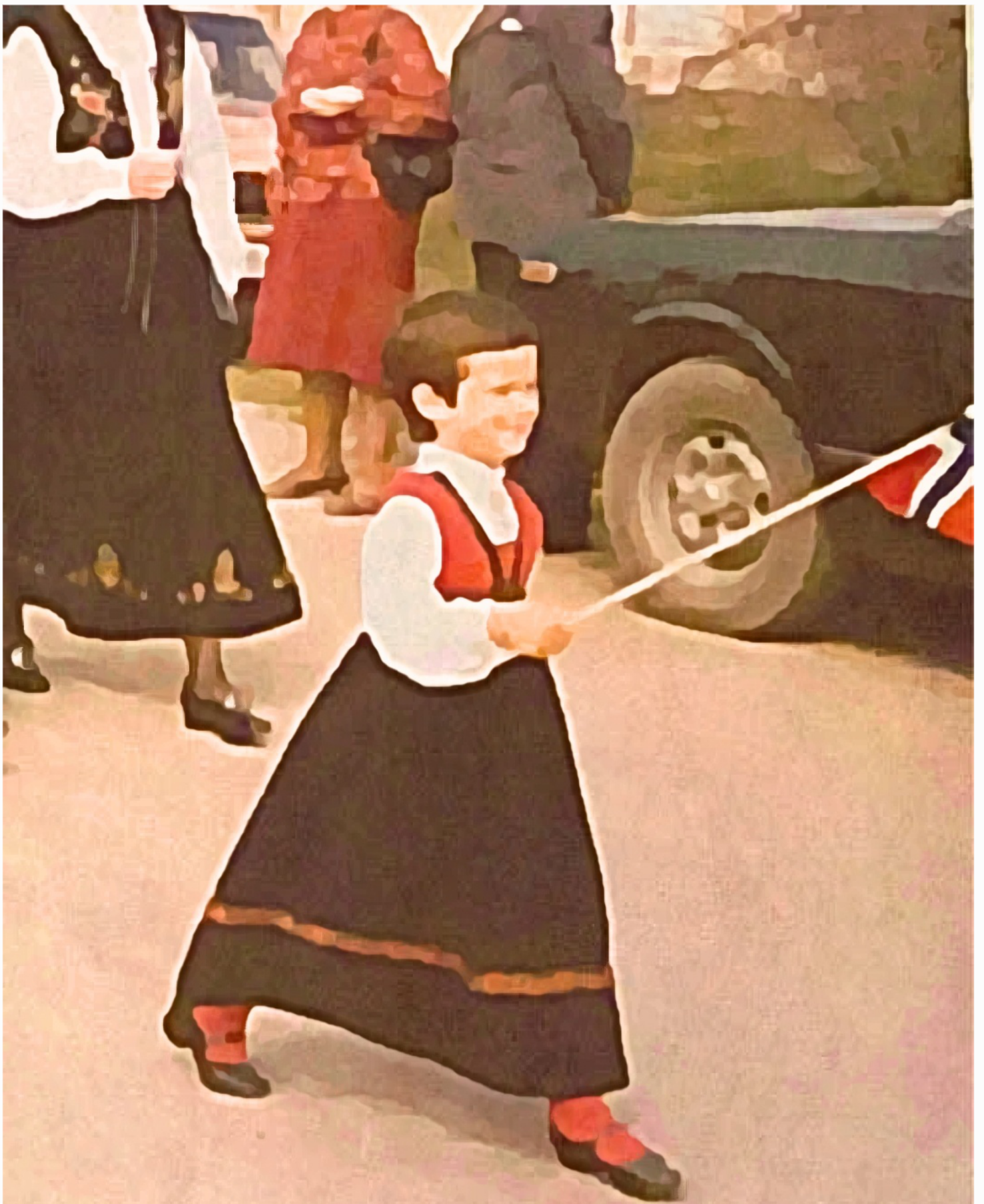
NORWAY WAS WHERE I WAS RAISED